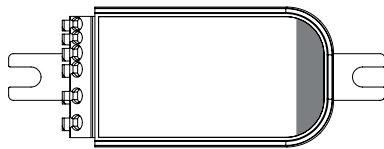
■ Antenna location

When the device is mounted on a metal plate (e.g. frame of a luminaire), it may efficiently block the radio frequency signal. In this case, a cut-out underneath the antenna may be needed for the RF signal to exit the structure. The cut-out area should be as large as possible. Also the device should be placed as far away from any vertical metal structures as possible.